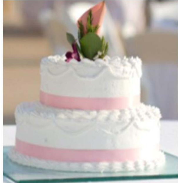
Standard Cake for Secrets of Love and Secrets Ultimate Wedding Package

*Flowers for the cake are not included but can be added for an additional cost. Please ask your wedding coordinator for customized cakes and flavors.