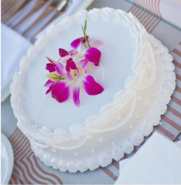
Standard Cake for Secrets in Paradise Wedding Package