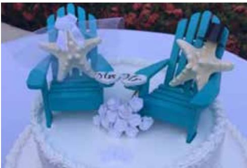
Cake topper $20 USD