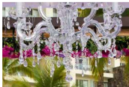
Chandelier from $250 USD