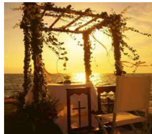
Canopy 6 $950 USD