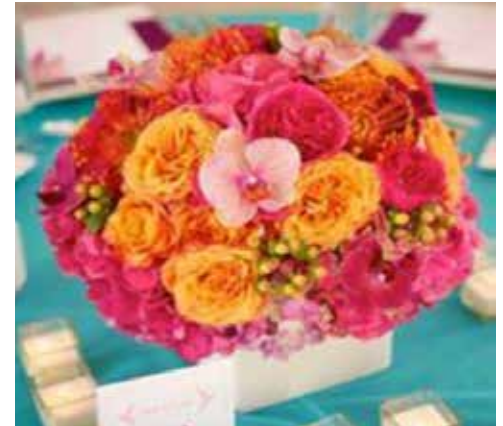
Roses and carnations $75 USD