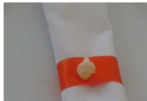
Ring for napkin from $4 USD each