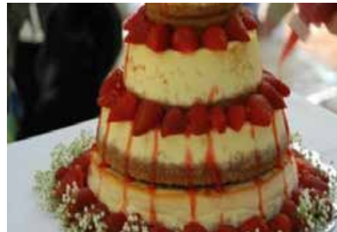
Cheese cake $2 USD extra for each guest