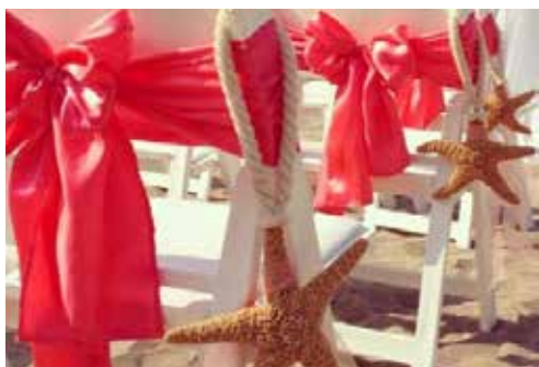
Starfish for chair from $10 USD each

These are circular string lanterns with a white light on a bulb in the middle. They are available in white, royal blue, fuchsia, orange, and green.