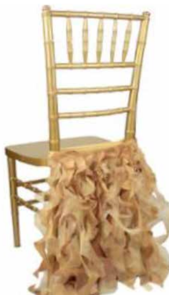
Mermaid Tail Semi-Cover $7 USD each