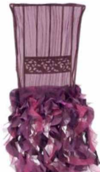
Complete Mermaid Tail Chair Cover $9 USD each