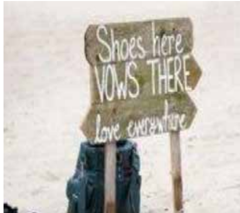
Wedding sign $60 USD