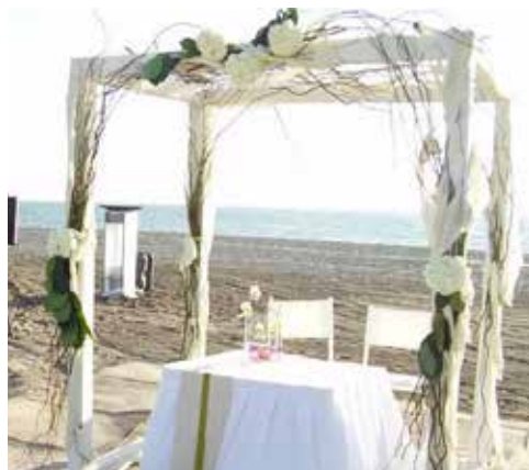
Canopy 2 $650 USD