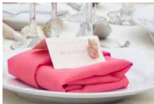
Colored Napkins $4.50 USD each (Different colors available)