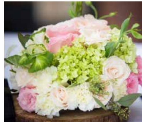
Roses, carnations and hydrangeas $75 USD