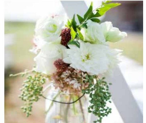
Flowers for chair from $20 USD each