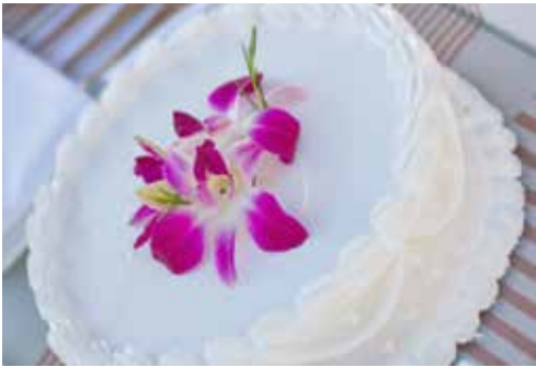
Standard cake for your moments wedding package

Flowers and Cake topper for the cake are not included, they can be quoted with prior notice. Basic cakes are included with all wedding packages for 10 to 25 guests. Customized cakes and flavors can be quoted with prior notice.