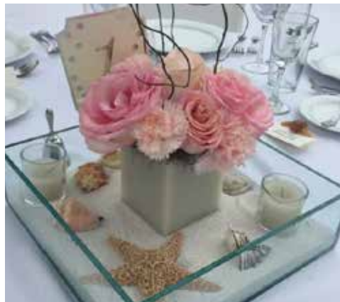
Roses, carnations and starfish $65 USD