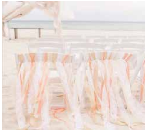
Bows for chairs from $7 USD each