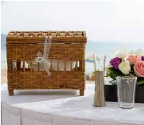
2 doves release $290 USD