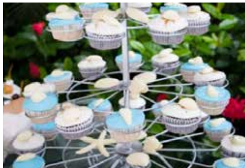
Subject to quote