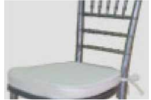
Silver or Gold Chiavari Chair $9 USD each