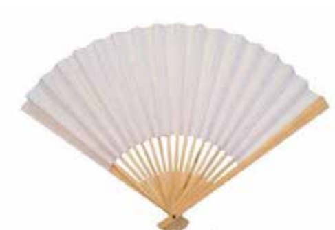
Fans from $5 USD each