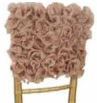
Short Moroccan Style Chair Cover $7 USD each

1. Colors: Hot pink, purple, orange, green, red, turquoise, silver, gold and white. 2. Colors: Hot pink, pink pale, purple, orange, turquoise, silver and gold. 3. Colors: Hot pink, purple, orange, red, green, turquoise, black, silver, gold and white lace.