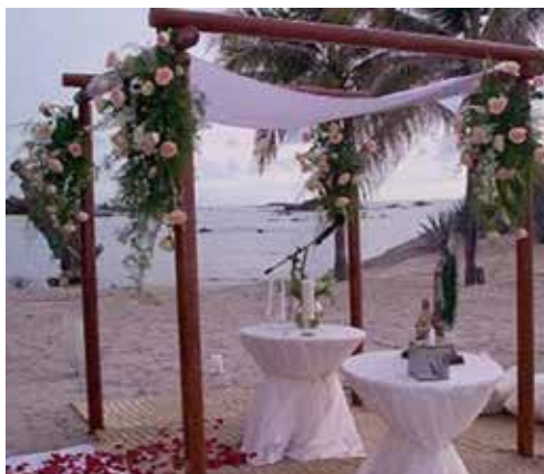
Canopy 4 $580 USD