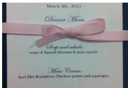
Printed menus from $4 USD each