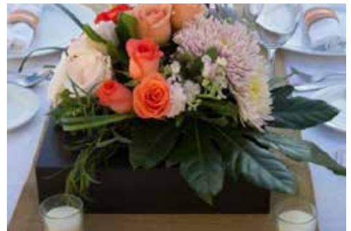
Roses, mums & greenery $65 USD