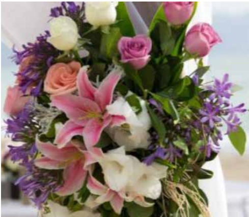
Ceremony floral arrangements starting at $95 USD