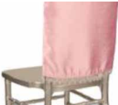
Medium Shantung Chair Cover (2) $4 USD each