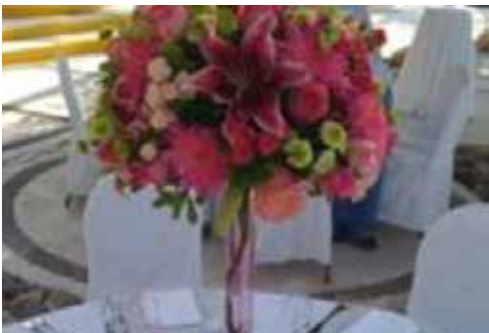
Roses, mini roses, lilies, mums & astromelias $180 USD