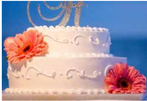
Standard cake for Now to eternity & Divine wedding package