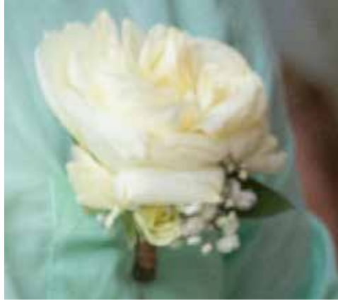
Boutonniere $25 USD