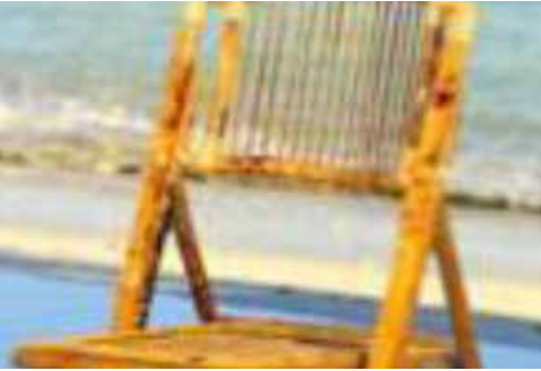
Bamboo Chair $10 USD each