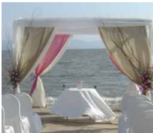
Canopy 1 $650 USD