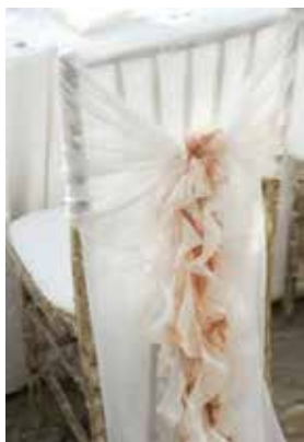
Complete Organza Chair Cover Pony Tail $9 USD each