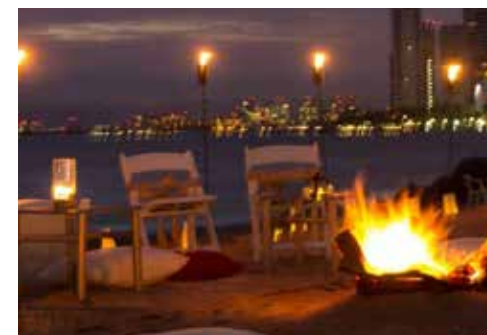
Subject to quote