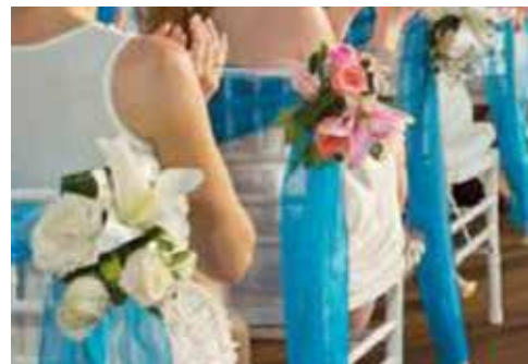
Flowers for chairs from $35 USD each