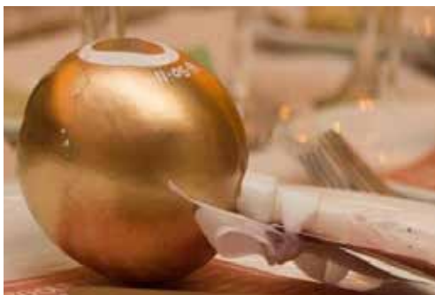
Personalized hand painted maracas $5 USD each (Different colors available)