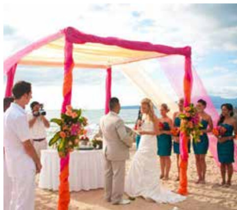
Canopy 5 $610 USD