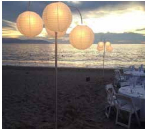
$75 USD each