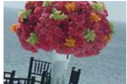
Carnations $185 USD