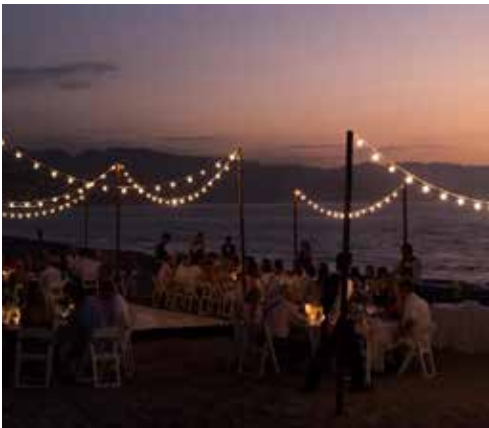
Hanging bulbs $120 USD each string