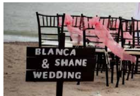
Wedding sign from $60 USD