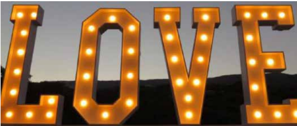
Lighting letters LOVE $500 USD