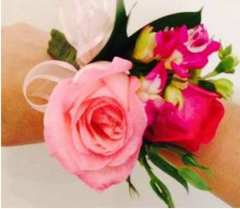
Corsage $35 USD

Customized samples of flowers and decor not included in our packages are subject to quotation. Prices are based on Mexican non-exotic flowers (Ask your wedding coordinator). The options are limitless for upgraded or customized flowers, if you have a picture of description let us know at least a month before and we will get a quotation. These are circular string lanterns with white light on a bulb in the middle. They are available in white, royal blue, fuchsia, orange, and green.