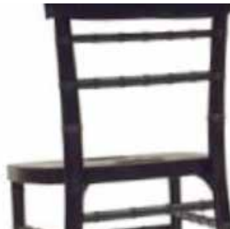
Medium Shantung Chair Cover (3) $4 USD each