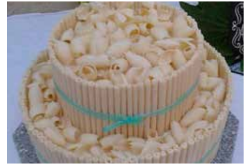
White chocolate decoration $70 USD