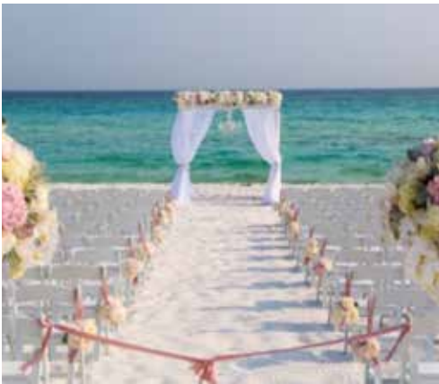
Wedding Ceremony set up $1500 USD