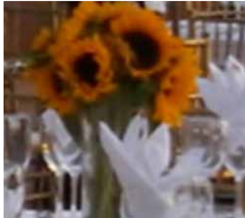
Sunflowers $65 USD