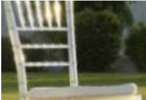
Ghost Chiavari Chair $9 USD each