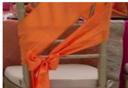
Bow for chair $4.50 USD each (Different colors available)