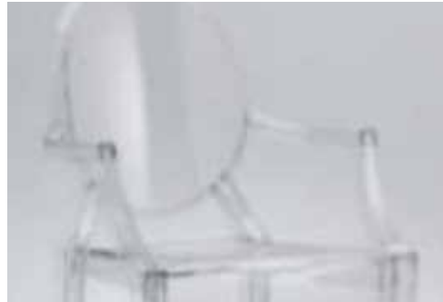
Ghost Chair $18 USD each