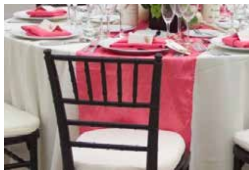
Table Runner from $35 USD (Different colors available)