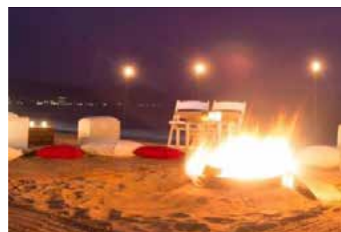
Subject to quote