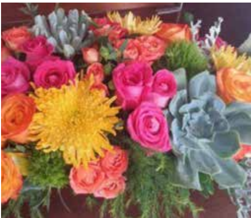
Succulents, roses, spider mums and tropical greenery $140 USD