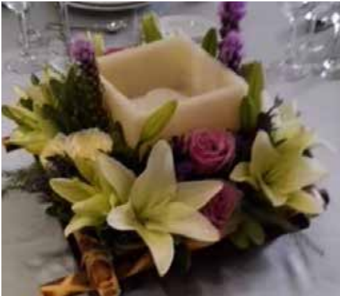
Lilies, roses and purple tropical flowers $200 USD

Centerpiece options are included in Now to eternity or Divine wedding package. Upgraded centerpieces are available upon request. Customized samples of flowers and decor not included in our packages are subject to quotation. Different colors available.