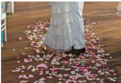
Rose petals for aisle from $55 USD