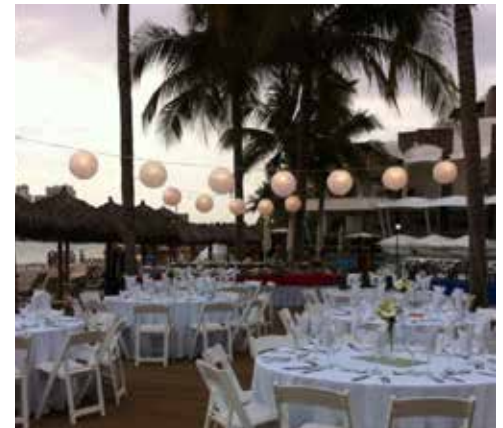
$90 USD each