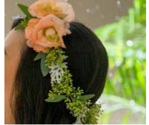
Crown of flowers $55 USD