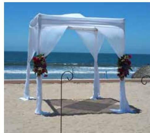
Canopy 3 $500 USD