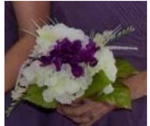
Bridesmaid bouquet from $55 USD