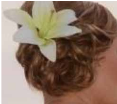
Flower for hair from $20 USD