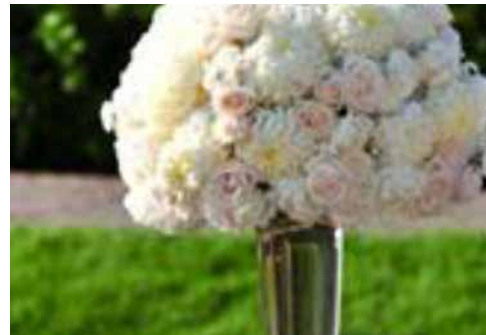
Roses and Mums $200 USD Only roses $285 USD