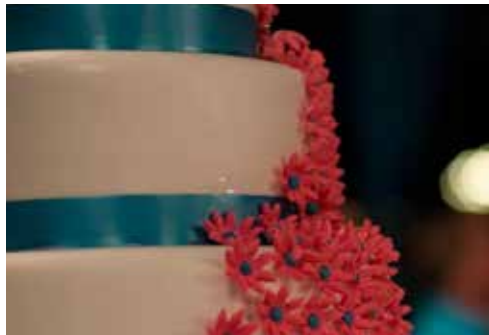
Fondant wedding cake with ribbon $7 USD extra for each guest