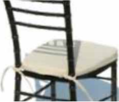
Chocolate Chiavari Chair $9 USD each