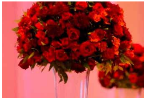
Roses, mums & astromelias $140 USD