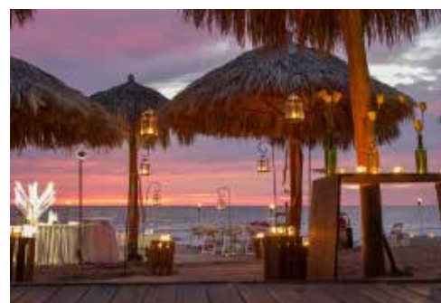
Subject to quote