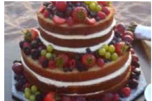
Fruit decoration wedding cake $40 USD