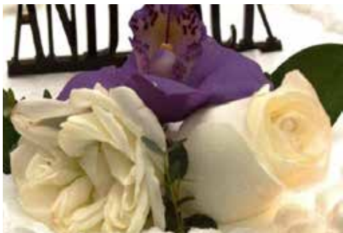
Cake Flowers from $25 USD