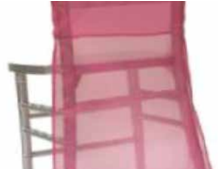
Complete Organza Chair Cover (1) $5 USD each