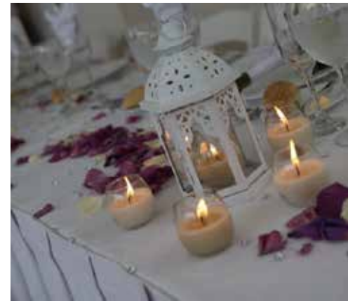
Lantern with rose petals and votive candles $65 USD each