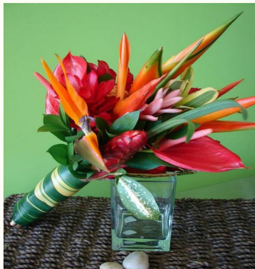
Brides Bouquet and boutonniere to match with the bouquet

Tropical Flowers are included in the wedding in paradise package.