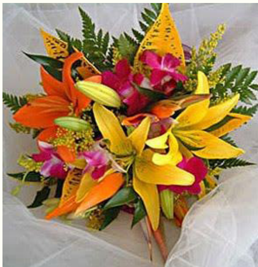
Bride's bouquet and groom's boutonniere, two boutonnieres and two corsages for wedding party

Tropical and seasonal flowers included in the wedding In Paradise package