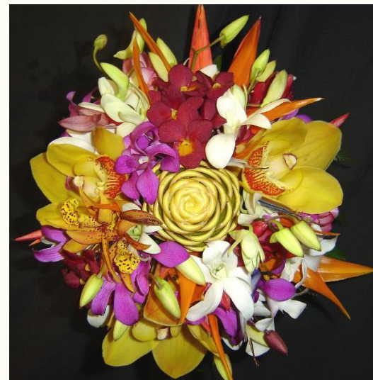
Bride's bouquet and groom's boutonniere, Two boutonnieres and two corsages for wedding party

Tropical, dendrobiums, and seasonal flowers are included on the Ultimate wedding package.