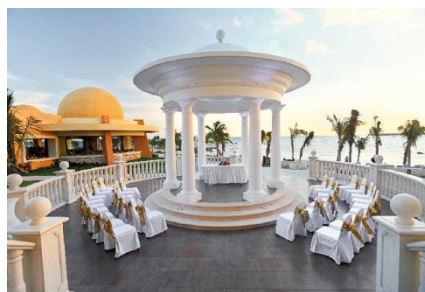
Gazebo Ocean Front (Palace Deluxe)

Barceló Maya Beach Resort boasts two miles of the best beaches in the Riviera Maya